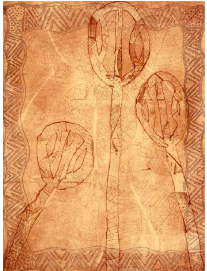
Irene Mungatopi Pink Beach Apple

Irene drew upon a finely tuned knowledge and memory of bush tucker with cultural associations over thousands of generations.