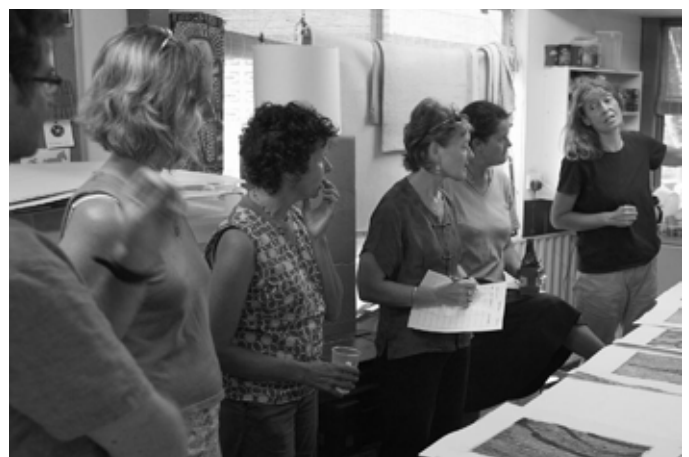
Replant artists looking at the finished proofs

Once the plate work is complete the artist approves the final proof. The printer produces a limited number of identical prints the same as the proof. At the end of the editioning process the printer will number the prints. This is called a limited edition. An edition number will appear on each individual print as a fraction such as 5/25 meaning that this particular print is number 5 of 25 prints made. The artist then signs the prints in pencil. Limited edition prints are produced on the understanding that no further impressions of the image will be produced, so at the conclusion of the editioning process the plate is struck (damaged) to prevent further editions of the same matrix being made. For the Replant project editions of 40, 30, 20 and 15 were made.