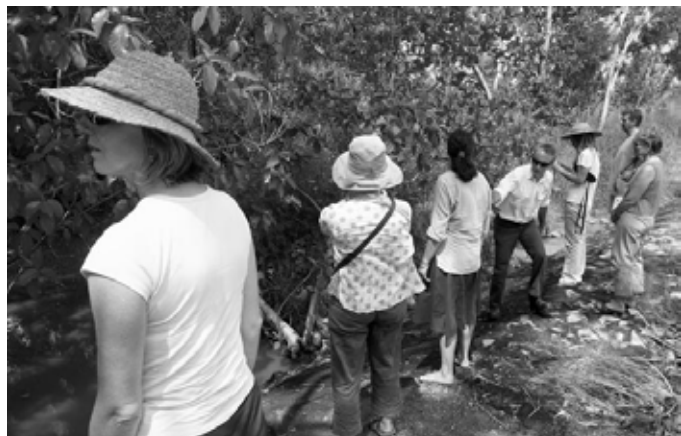
Replant artists exploring the bush on the way to Daly River resolving images and proofing the etchings.