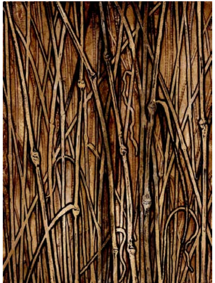
Winsome Jobling Spear Grass etching on paper and chine colle' on hand made paper, (banana, cotton, sugar palm and gamba grass)

Winsome focused on Spear Grass as the dominant element in the 'Top End' landscape during certain seasons. Replant occurred towards the end of the wet season when the Spear Grass was shedding millions of awned seeds across the savanna landscapes. After the wet season the knock em down winds flatten the grass, which mulches the ground and provides nutrients for the soil, the plants and many insects. Later at the beginning of the wet, after having sat dormant for months, the seed awns are stimulated by the high humidity and they drill the seed down ready for germination with the first rains, and the growth cycle begins again.