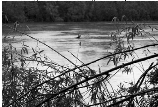
The mighty Daly River near Nauiyu Community.

Merrepen Arts now has a gallery and shop, office, kitchen facilities, print and canvas stretching workshop, meeting room, painting/workshop area and glass making facilities. The gallery is used for display and sale of art works and houses Merrepen Art's own collection of artifacts, art works and cultural items that have been repatriated to the community. Merrepen artists produce acrylic canvas paintings, limited edition prints, natural fibre weavings, screen printed fabric, glass and sculptures.