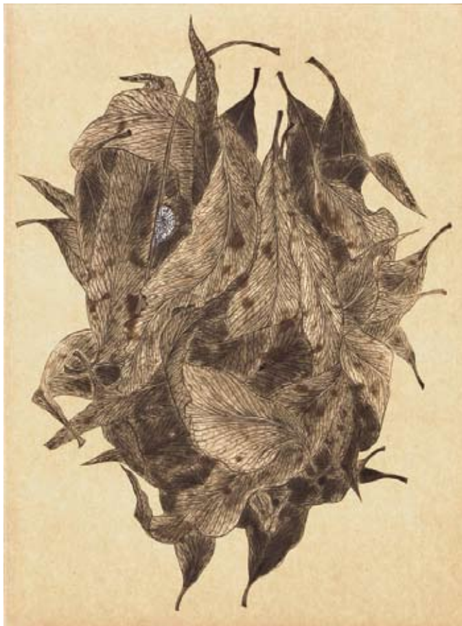
Fiona Hall Green Ant Nest

Much of Fiona's work over the past fifteen years has focused on botanical themes. The nature of her enquiry is intense and far-reaching. Her work often incorporates metaphors, and symbols linked by insightful and unexpected connections between the human condition and natural history. Fiona Hall is recognised nationally and internationally for her work and is represented in collections Australia wide.