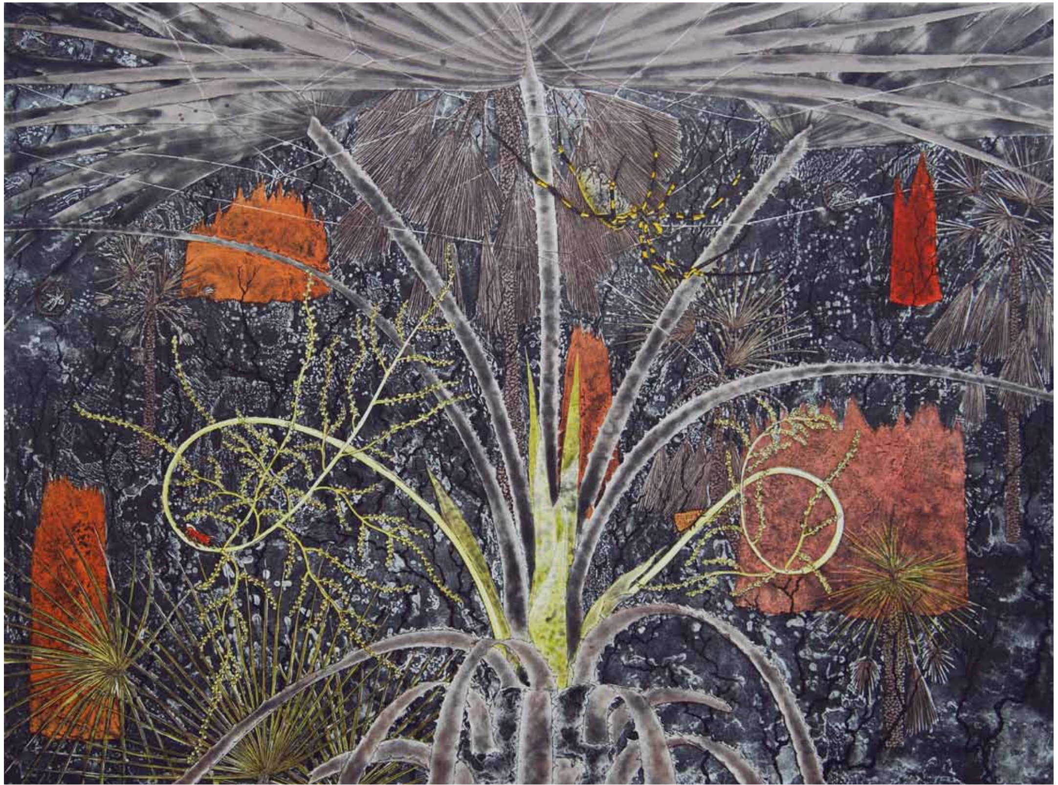
Fan Palm - Dhalpi 50 x 66 cm