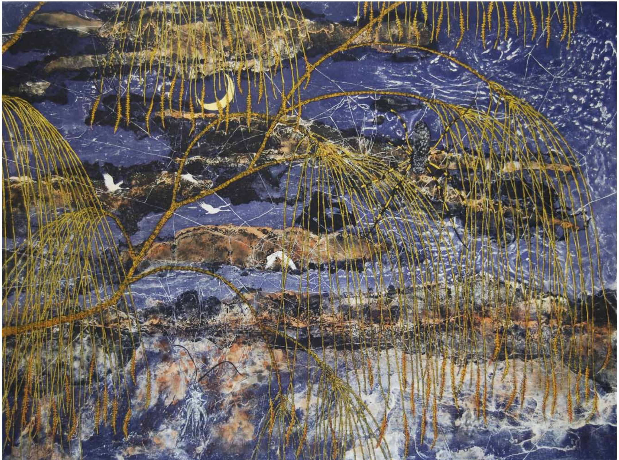
Casuarina - Mawurraki 50 x 66 cm