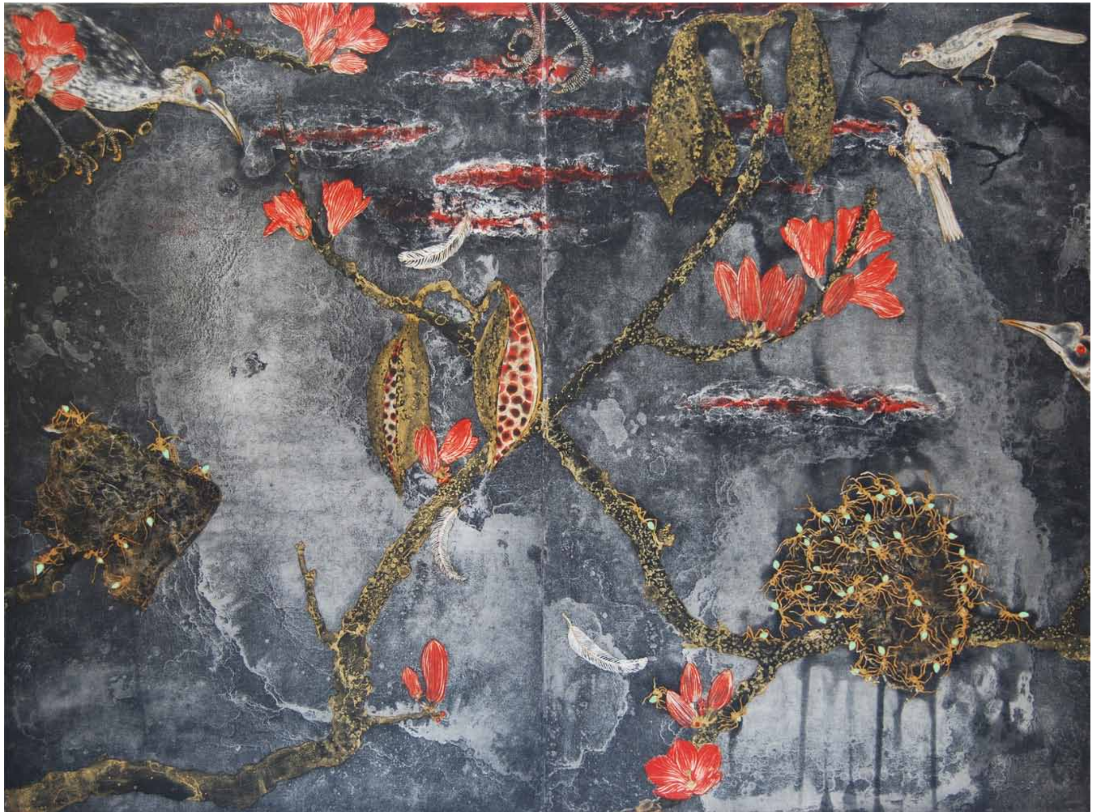
Brachychiton - Nanungguwa 50 x 66 cm