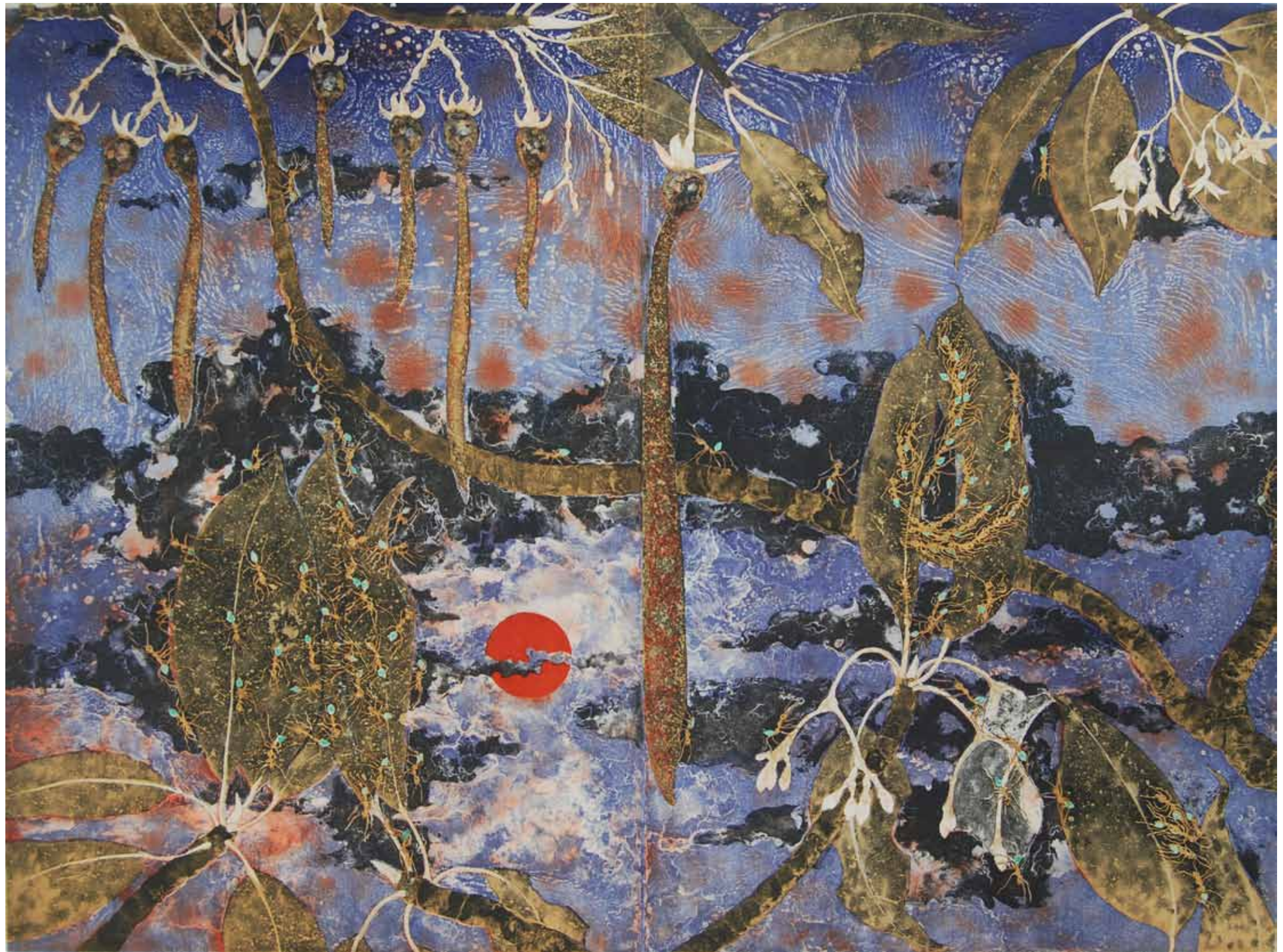
Mangrove - Wälm 50 x 66 cm