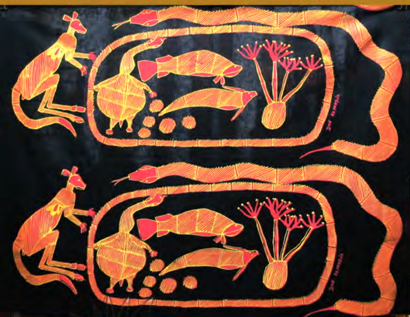
NGALYOD / SERPENT