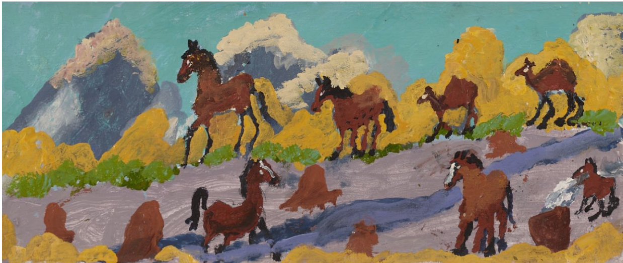
Lance James, Untitled, Acrylic paint on linen.