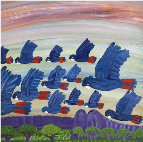
Kukula McDonald, Black Cockatoos , Acrylic paint on linen

She predominantly paints Black Cockatoos and knows where to find ‘big mobs’ of them in the Central and Western Deserts. Kukula also paints Uttumpatu, the rocky outcrops that form ridge lines or hills beside the community of Papunya. These landscape formations hold cultural significance for the people of Papunya.