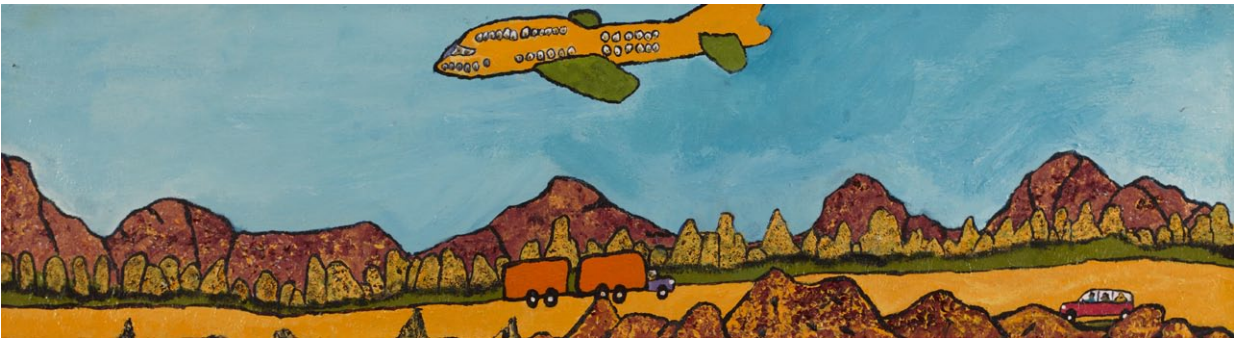
Billy Kenda Tjampitjinpa