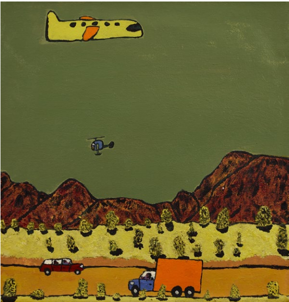
Billy Kenda, Untitled 2010, Acrylic paint on linen

Billy paints landscapes which are full of texture with a strong sense of country. His use of colour mirrors a modern Asian aesthetic with a wide use of pastels within his work.