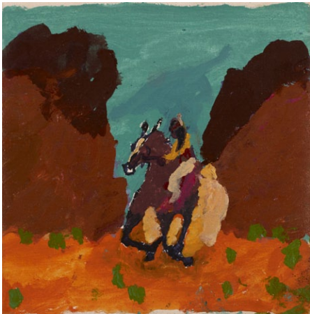
Lance James, Untitled 2010, Acrylic paint on linen.

Lance is a wonderful draughtsman with a keen eye for the subtle movements of horses and outstation life in the desert.