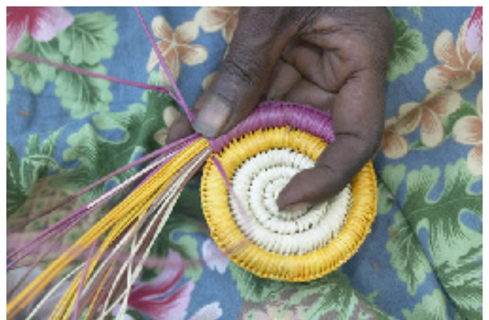
In Arnhem Land women use mainly pandanus for their coiling and natural dyes from plants for colouring.

Coiling has also been part of western craft practice in Australia. There are very few historic records about its use, though it appears to have been practised from at least the turn of the twentieth century onwards, and has experienced a recent revival due to the