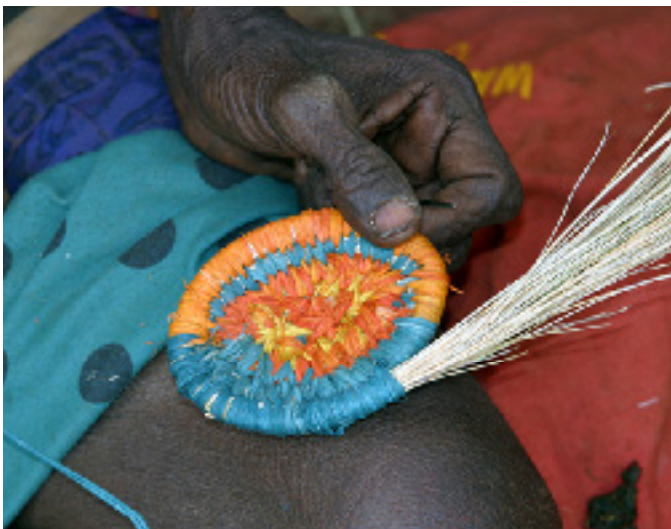
In the desert the traditional use of fibre was limited now women make coiled basketry with native grasses, colourful wool and commercial raffia http://www.artbacknt.com.au

Aboriginal artists use the most suitable fibre available in their environment for coiling. In the tropical north the weavers prefer pandanus while in south-east Australia sedge grass is used. These fibres are relatively long, water resistant and produce a reasonably rigid form. In the desert regions where coiling has been recently introduced, artists prefer softer materials such as wool or commercial raffia for the outer wrapping, with stiff native grasses normally used for the foundation bundle to provide the basket's rigidity.