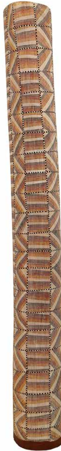
Deborah Wurrkidj, Lorrkon - Hollow Log 483-17 , ochre pigment on stringybark, 158 x 17 cm, $4100