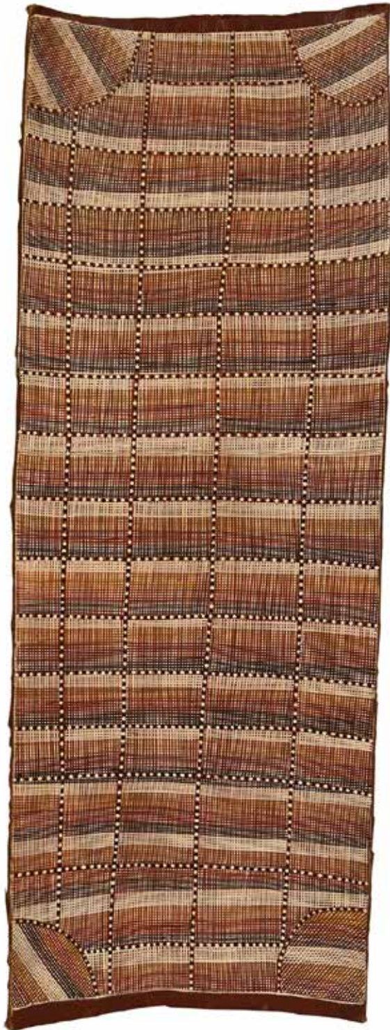
Melba Gunjarrwanga, Wak Wak 526-11 , ochre pigment on stringybark, 105 x 38 cm, $2000