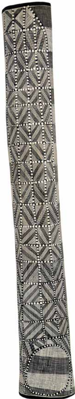
Susan Marawarr, Lorrkon - Hollow Log 1009-15 , ochre pigment on stringybark, 119 x 14 cm, $5700