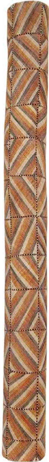
Melba Gunjarrwanga, Lorrkon - Hollow Log 185-16 , ochre pigment on stringybark, 139 x 13 cm, $3400