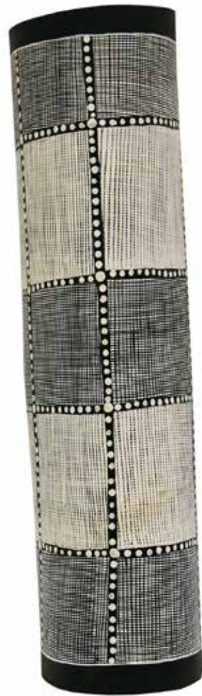
Susan Marawarrj, Lorrkon - Hollow Log 479-17 , ochre pigment on stringybark, 60 x 16 cm, $2200