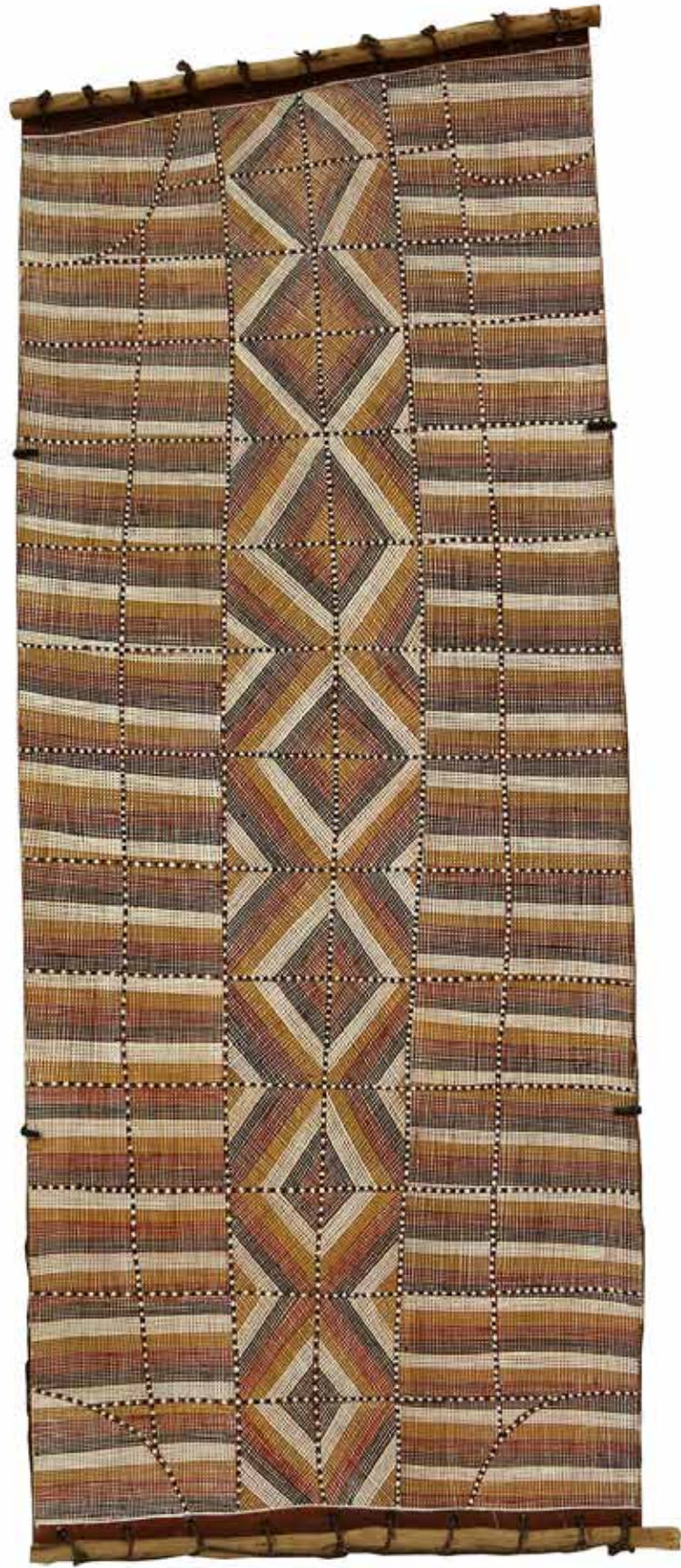
Melba Gunjarrwanga, Wak Wak 1209-13 , ochre pigment on stringybark, 139 x 52 cm, $2750