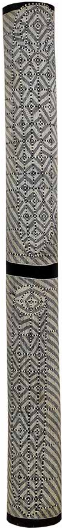
Susan Marawarrj, Dilly Bag at Dilebang , ochre pigment on stringybark, 170 x 17 cm, $8200