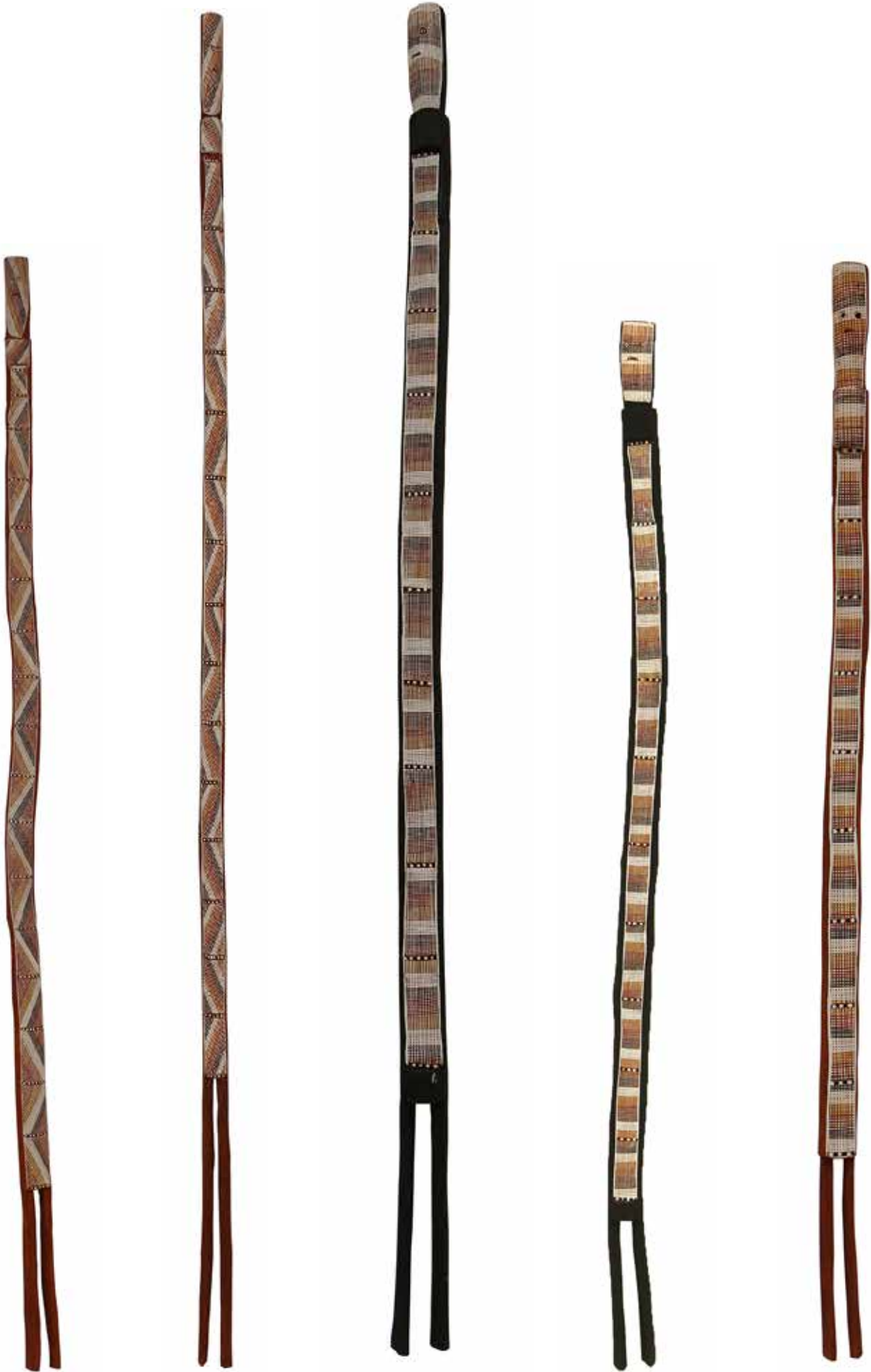
Mimih Spirit, various artists, POA