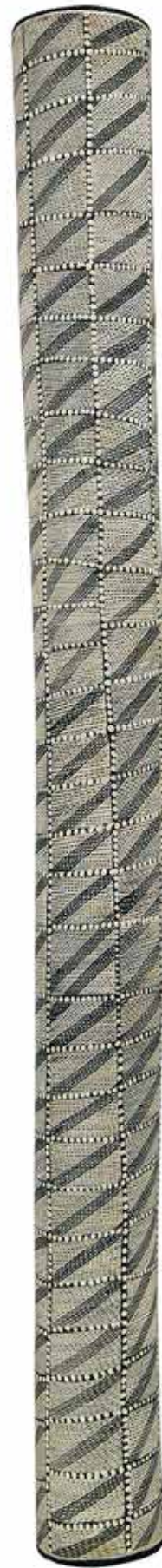
Susan Marawarr, Lorrkon - Hollow Log 13-16 , ochre pigment on stringybark, 152 x 14 cm, $5700