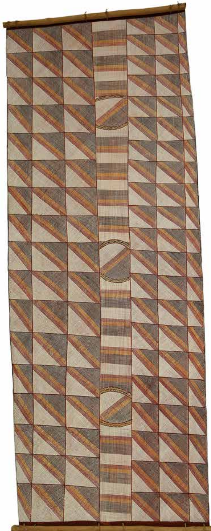
Jennifer Wurrkidj, Bark Painting 482-17 , ochre pigment on stringybark, 170 x 60 cm, $3850